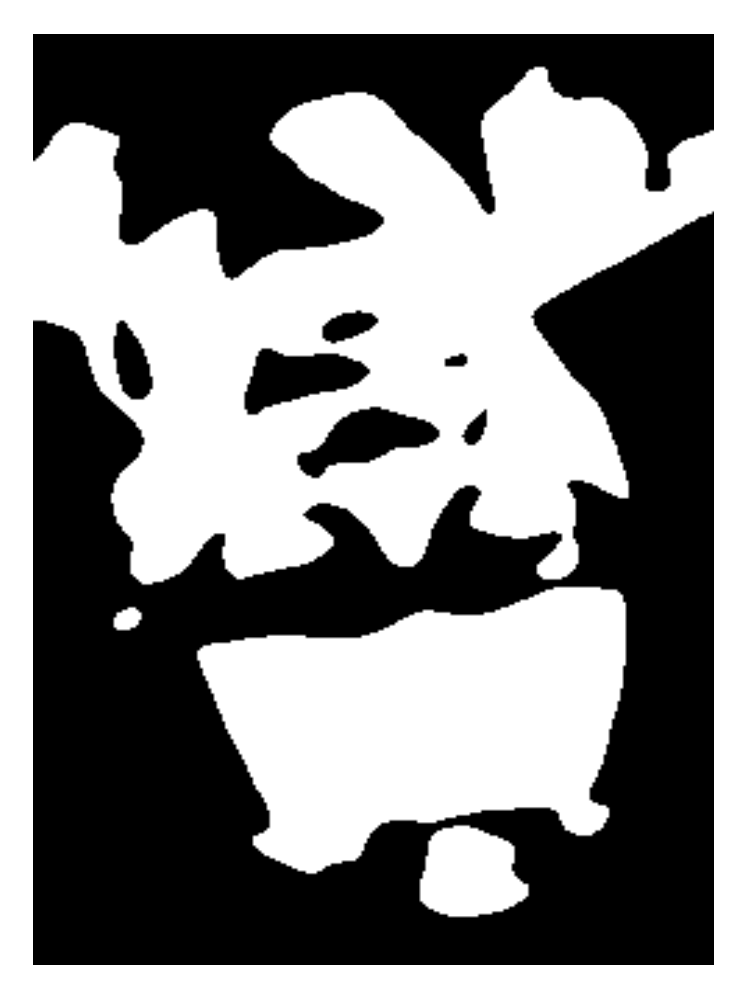
Figure 1: Can you recognize what this is? If not, rotate the image. Note that once you turn it back around the object is now clear.

and colour as in grapheme-colour synaesthesia (van Leeuwen et al. 2013), or result from systematic training as in perceptual learning (Schwiedrzik et al. 2009, 2011). These studies allowed us to test not only whether the behavioural threshold of conscious perception is fixed, but also how previous knowledge would affect the neural "construction" of conscious percepts.