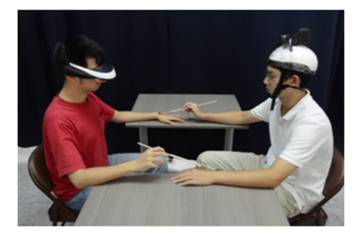
Figure 1: Experimental set-up.

chronous conditions, the average scores on WQ1 were 1.58 and 1.04 in Experiments 1 and 2 respectively, and the average scores on WQ2 were -1.03 and -0.50 in Experiments 1 and 2 respectively.